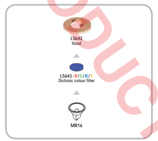
Other accessory stacking options may be available - consult factory