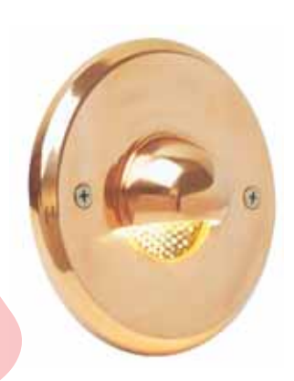
LS642 Copper Hood