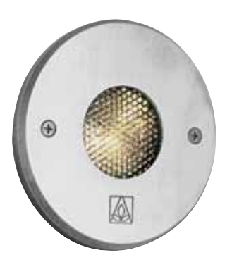
LS381 Melia II

NOTE: Product specifications are subject to change without notice. Any luminaire can become hot - take care with appropriate use and placement.