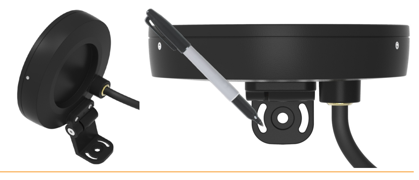
Step 3 Drill holes for mounting bracket as marked.

Step 2 Place the luminaire in the mounting position and mark the anchor points you wish to use.